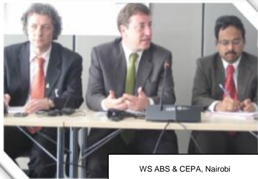
WS ABS & CEPA, Nairobi