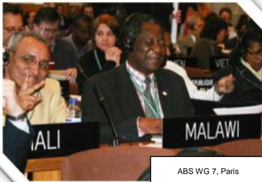
ABS WG 7, Paris