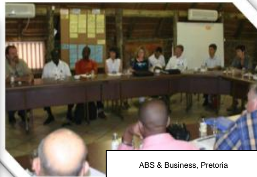
ABS & Business, Pretoria