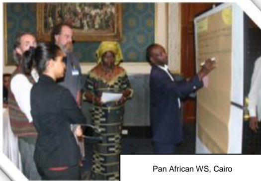
Pan African WS, Cairo