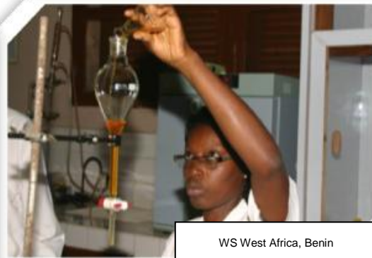
WS West Africa, Benin